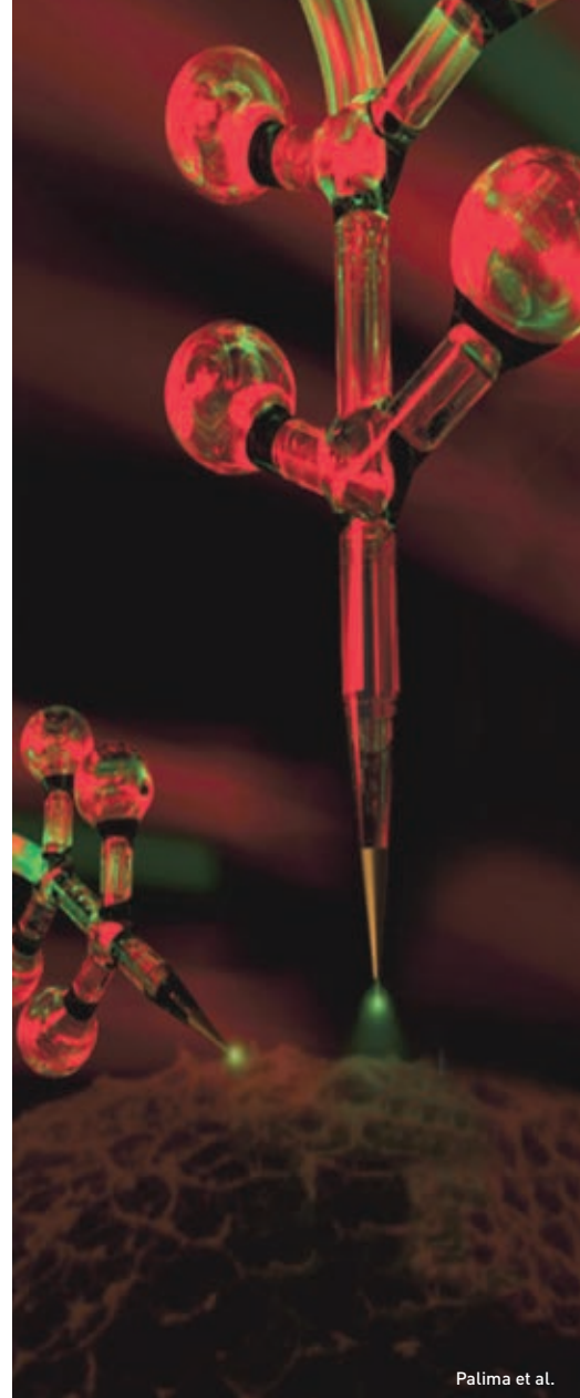
Palima et al.